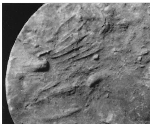
Fig. 4. Monomorphichnus isp. in finely laminated sandstone close to the base of the Sõru Formation in the Kasari-16 drill core, 315.8 m, \times 1 . Institute of Geology, Tallinn Technical University, No. IG Va 1847.