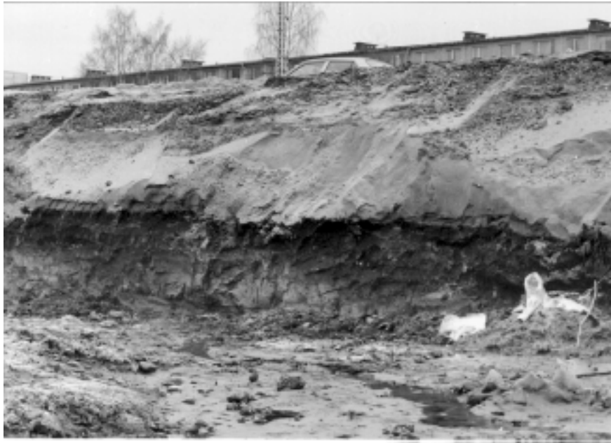
Photo 1. About 1 m thick peat layer at Lepistiku is buried by 2 m thick sand. View from south to north, towards Sõpruse Avenue. Photo by A. Müidel, 2000.