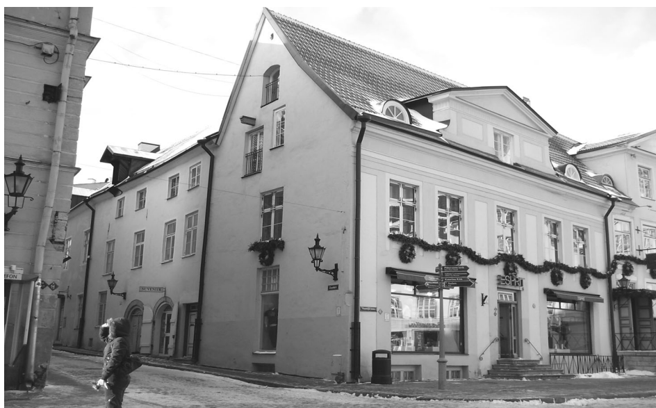
Seebeck's birth house in Tallinn at Raekoja plats 4/Dunkri 2 (Jan. 2007).