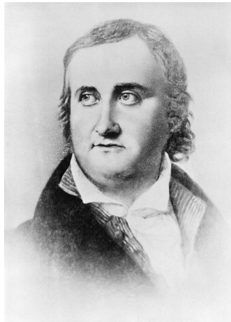
Photo of a painting, German Museum, Munich.

T. J. Seebeck, born 09.04.1770 in Tallinn (Reval), Estonia, past away 10.12.1831 in Berlin, Germany