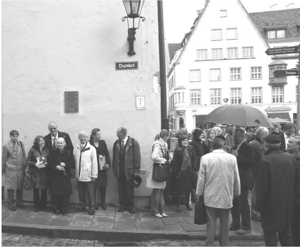
Opening of the memorial board on the wall of Seebeck's house on May 11, 2007.