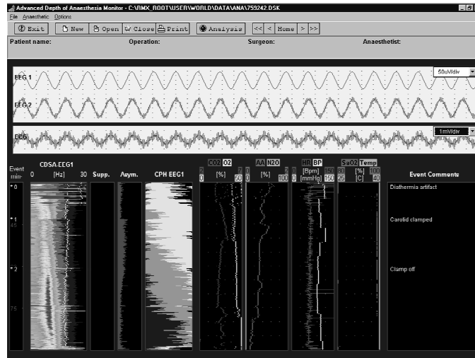
Fig. 2. Layout of the ADAM monitor; the second window from the left presents compressed spectral array, the class probability histogram is presented in the fifth window from the left (from Prof. Carsten Eckhart Thomsen with permission).