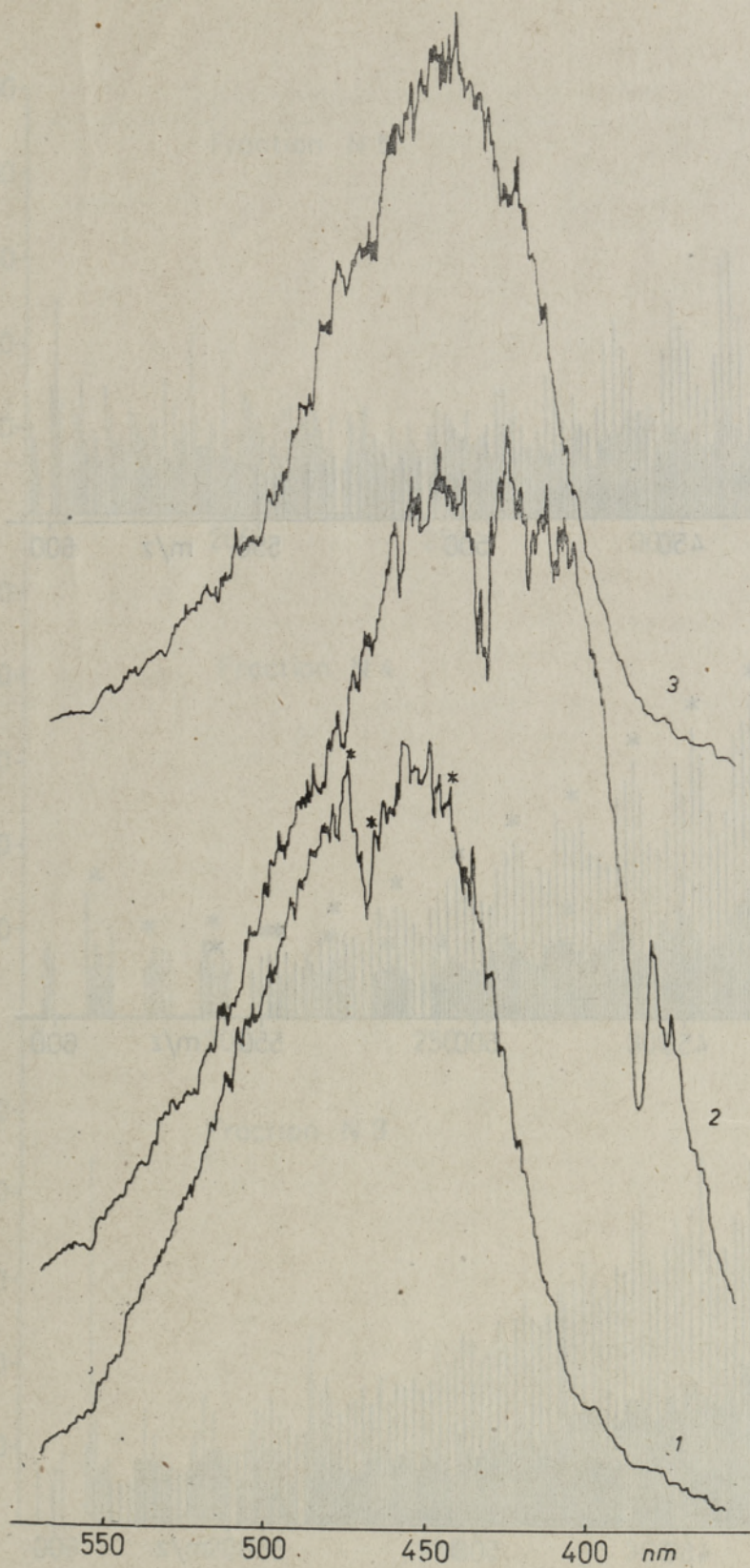
Fig. 1. Phosphorescence spectra recordings of fractions of the reduced NOC; 1 fr. 4, 2 fr. 5, 3 fr. 6.