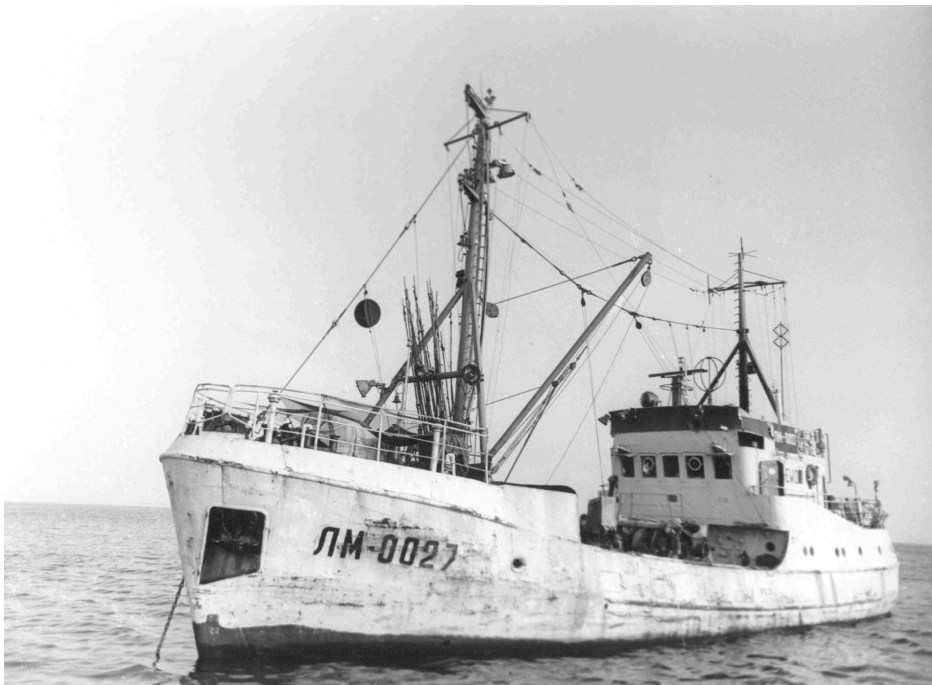
Photo 8. R/V MPTP-0027 .