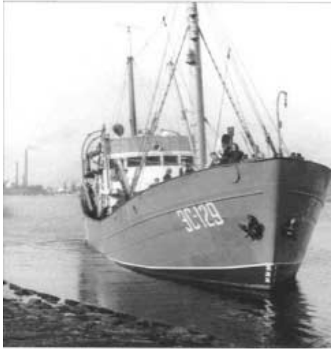
Photo 5. R/V CPT-129 .