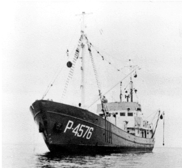
Photo 6. R/V Mazirbe .