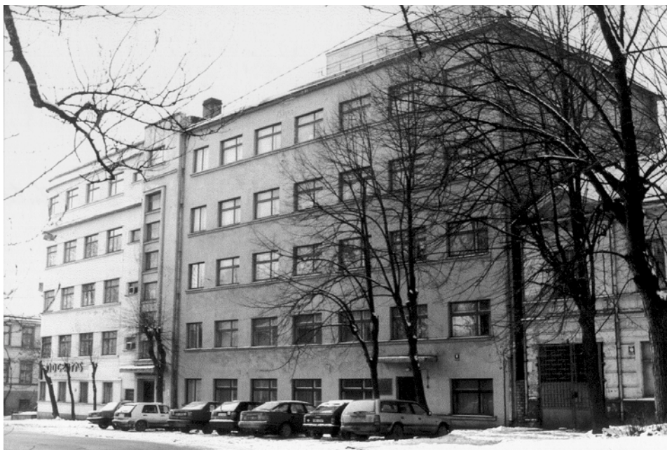
Photo 4. Building of the Baltic Fisheries Research Institute and later of the Latvian Fisheries Research Institute in 6/8 Daugavgrīvas Str. in Riga since 1973.

Already since 1946 the marine research of the Latvian Department and further of BaltNIIRH was supported by the following expedition and research vessels: MPT-48 (31 m long, operating from 1947 to 1950), Liepāja (31 m, 1948–53), CPT-129 (38 m, 1951–55), Mazirbe (39 m, 1958–78), Besspokojnij (32 m, 1967–87), MPTP-0027 (32 m, 1972–85), Zvezda Baltiki (55 m, 1977–91), and Isslodovatel Baltiki (later Baltijas Pētnieks , 55 m, 1984–93) (Photos 5–10).