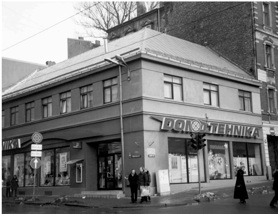
Photo 2. From 1945 to 1948 the Latvian Department of VNIRO was situated on the second floor of this building in 44 Krišjāņa Barona Str. in Riga.

This period is characterized by stepwise development of comprehensive fisheries and marine research in Latvia, including the institutional strengthening, organization of regular surveys on board research vessels, building up long-term databases, and development of international cooperation in the management of marine resources. In this period practically all Latvian fisheries research and the related environmental investigations were concentrated into one institution. Its birth date is 17 May 1945, when based on the former Fishery Laboratory, the Latvian Department of the All-Union Research Institute of Marine Fisheries and Oceanography (VNIRO) (Photos 2 and 3) was established in Riga. The work