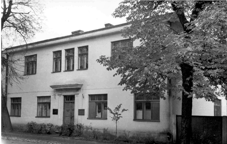
Photo 3. Building of the Latvian Department of VNIRO and later of the Baltic Fisheries Research Institute in 1 M. Bezdelfigu Str. in Riga from 1948 to 1973.

started with 15 researchers and assistants in three laboratories – of Ichthyology, Oceanography, and Technology. From the very beginning the Latvian Department of VNIRO started the complex monitoring type surveys in the Gulf of Riga and the open Baltic Sea on hydrology, hydrochemistry, phytoplankton and zooplankton, ichthyoplankton and benthos, as well as on the distribution, feeding, growth, and spawning success of cod, herring, sprat, and flounder. In 1947 six field stations for coastal observations were established (in Liepāja, Ventspils, Kolka, Mērsrags, Lielupe, and Skulte) and log-books were introduced in the Latvian fishing fleet. The Department had to supply the fishery with regular maps on the distribution of fish stocks. Already in 1947 the surveys covered the area of the Baltic Sea from the Gulf of Gdansk to Saaremaa Island.