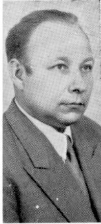
Fig. 2. Taivo Laevastu (born E. Granfeldt), a famous Estonian marine scientist, who succeeded in escaping the occupation.

contribution and without the right to vote on administrative and financial matters). In 1926 Estonia withdrew from the Council (probably due to financial difficulties) but continued regular presentation of data on monitoring of meteorological, physical, and chemical parameters of the sea (up to 1939) and submitted some data on marine fish (Went, 1972; Ojaveer et al., 2000).