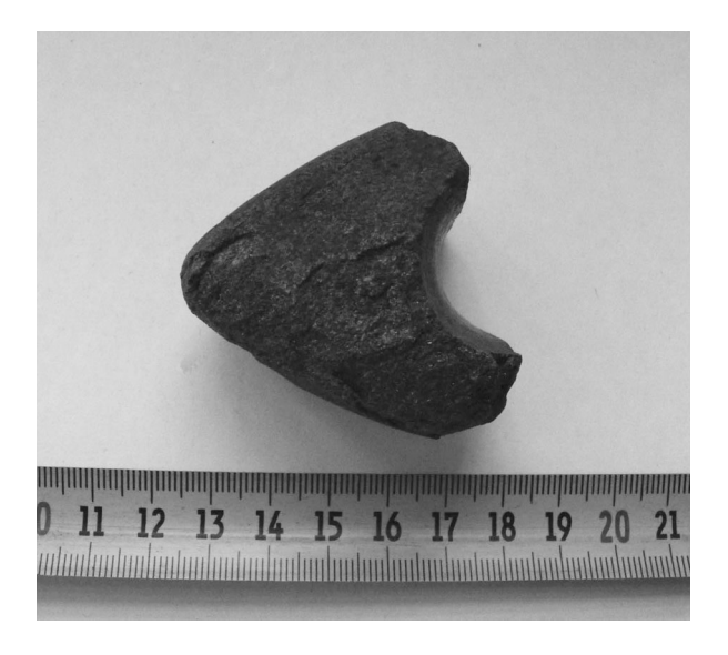
Fig. 3. Fragment of a stone axe from Piila Viking Age stone grave, Saaremaa (SM 10206/A 1468: 37). Joon 3. Kivikirve katke Piila viikingiaegsest kalmest Saaremaalt.