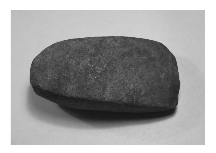
Fig. 4. Unfinished stone axe from Lülle ship-grave, Saaremaa (AI 4409: 31). Joon 4. Lõpetamata kivikirves Lülle laevkalmest Saaremaalt.