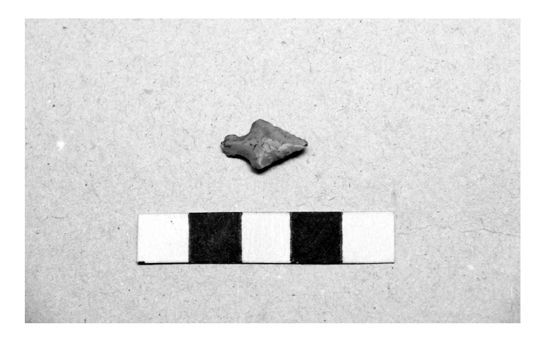
Fig. 5. Flint arrowhead from Ehmja stone grave (AM 26072/A 554: 390). Joon 5. Tulekivist nooleots Ehmja kivikalmest.

Having Uusküla grave freshly in mind, we should at this point mention the custom of breaking quartz on the graves. The tradition has been discussed in more detail by Carlie (1999) who gives an example from Sweden where broken quartz has been inserted into graves from the Bronze Age up to the Viking Age in amounts that vary from one piece to 500 (Tiraholm) up to 1000 kilograms (Sannarp) (Carlie 1999, 54). According to the researcher, quartz was especially important for its white colour and thus for the fertility cult, linking it with re-birth and ancestors. The white stones also seem to be of protective function whereas the lumps and flakes have often been built into the walls or placed as the upper layer on top of the graves to protect it (Carlie 1999, 55 ff.). The deliberate breaking of quartz has been considered possible by Estonian researchers as well (see Lang 2000, 123). There are many other examples that seem to refer to the quartz' special meaning, for example the description of Pliny the Elder of quartz as a unique and most precious "thunderstone" (cited in Myhre 1988, 321). Also the descriptions in the folklore archives of Estonia refer to the possibility that quartz lumps have been considered thunderbolts with special curative and protective properties. I do not