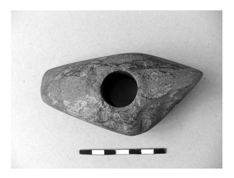
Fig. 6. Stone axe with traces of grinding – a possible "thunderbolt" from the village of Kõnnu (AI 6013).