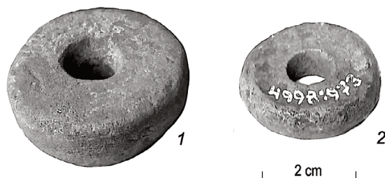
FIG. 3. Finds related to textilework from Estonian village sites. 1 – spindle whorl made of stone from the Uderna II village site (TÜ 2223: 112), 2 – spindle whorl made of lead from the Olustvere village site (AI 4998: 973).

made from cattle femur heads have been found at the Olustvere (AI 4998: 3011) and Mustivere (AI 3993: 1238) village sites. A spindle whorl made of lead (Fig. 3: 2) has also been also found at the Olustvere settlement site. Only five lead spindle whorls are known to me from elsewhere in Estonia. The first of these (TM A 43: A396) was found within an occupational layer dated to approximately 1230–1250 on the grounds of the University of Tartu Bortanical Garden, the second was found in the southern part of medieval Tartu (Aun 1998, plate II: 2), and the third in the southern suburb of Tartu (TM A 126: 1731). Two such items have been discovered at Tarvastu Castle in Viljandimaa (Valk et al. 2022, fig. 14: 7, 8). No parallels for this object have been identified in western regions. However, similar examples have been found in Russia, for instance in layers dating from the 10th to the 15th century in Novgorod (Sedova 1981, 156–157) and Pskov (Sergina 1983, fig. 18: 6–12). Spindle whorls constitute the most numerous find category among textile-manufacturing equipment in Estonia (Rammo 2015, 57) because they were made of stone, clay, bone, and metal, which preserve well in the ground.