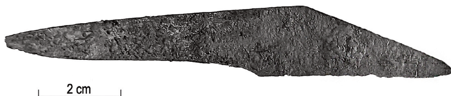
FIG. 4. Knife from the Uderna II village site (TÜ 2223: 511).

Woodworking tools are very rarely found, as they were often reused or reworked. The vast majority of woodworking implements – such as axes, knives, saws, and drill bits – were multipurpose. They were also used in everyday life, and it is generally not possible to determine from archaeological finds whether such tools were used by professional craftsmen or by others.