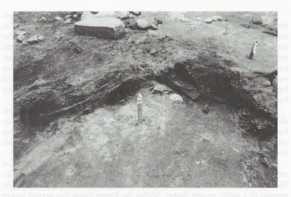
Fig. 4. The best-preserved part of the timber framework serving as the wooden foundation structure of the oven and remains of wood on its west side.