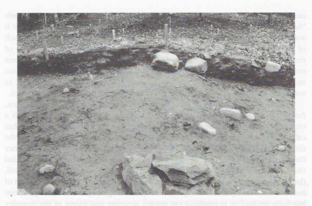
Fig. 1. The excavation area in the summer of 1998. The oven cairn is visible in section in the foreground.

Joon 1. Kaevand 1998. a suvel, esiplaanil ahjuvare.