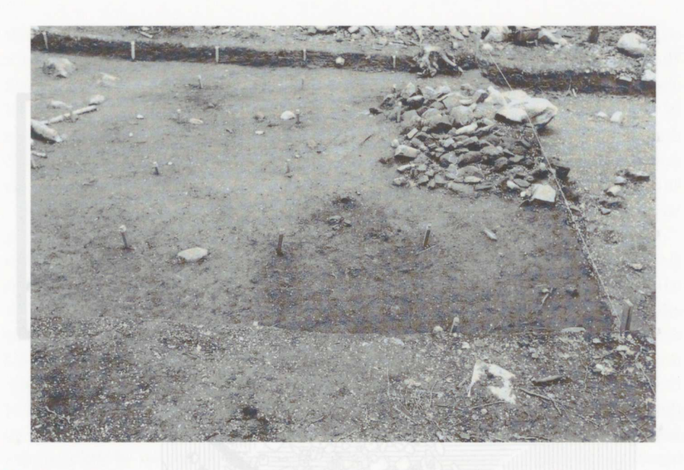
Fig. 3. The 1998 excavation area at level 3. The oven cairn is at the right edge of the picture, in the northeast corner of the building.

Joon 3. 1998. a kaevandi 3. kiht. Ahjuvare paremal, hoonepõhja kirdenurgas.