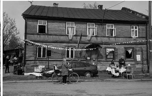
Figure 7. Knowing the neighbourhood and spotting the diversity. On the left: a local musician. On the right: people in a pop-up street cafeteria.

of Supilinn's peculiarity was important to 99% of the respondents (Supilinna Selts 2011). For a majority of the residents the boundary of their home is not their apartment walls, their house door, nor their garden gate or even their home street, but according to the results from the surveys their home (perception of home) spreads to the border of Supilinn.