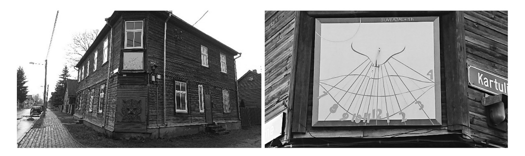
Figure 5. Example of the activities of the association with horizontal structure. The sundial has been mounted on the wall of the house in Supilinn by the initiative of local residents, and another resident initiated the display of knitted cat picture on the wall (lower). The board of the association helped to finance the instalment of the the sundial and settle the agreement with the owner of the house for the cat-picture. These projects were carried out by the residents with ideas, the board only provided support.

events or initiatives would take place without community engagement (see Figure 5). For instance, if someone proposes to plant trees, the same person should be willing to take the lead. The board will support the initiative and helps to find investors and coordinates cooperation with local government (incl applying of required permits) if necessary.