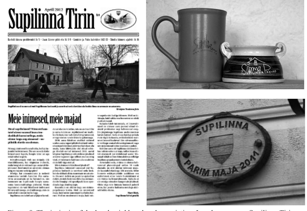
Figure 8. The insignia of the local neighbourhood association. Local newspaper Supilinna Tirin, Supilinn's mugs, and the label of the best house of the year (i.e. the prettiest).

Active members of the voluntary work-based organization have influential positions in their everyday life as well and the established connections help outside of the collective activities. Therefore, the benefits of social capital are two-sided: personal and public. Strong social networks help a person to make a career if they know how to take advantage of the circle of acquaintances to which they are connected. The social control in the neighbourhood works in a similar way. Since everyone knows everyone else, there is less crime, a reliable chimney sweep can easily be found or getting a free refrigerator from your neighbour is usual.