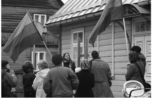
Figure 4. Events of Supilinn association that create social trust and engage the community. On the left: Organized campaign to preserve the cobbled street (a public statement about paving all streets with asphalt). On the right: Procession with flags of Supilinn in recognition of its most beautiful houses in 2012. Sources: Haamer 2003. Nutt 2012.