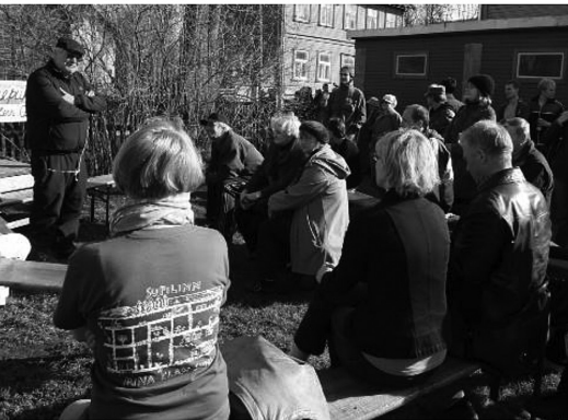
Figure 6. Local identity is very strong, almost all residents self-identified with the Supilinn community. They label not only the district border but also themselves. On the left: the mark of Supilinn district border – coat of arms on the wall of a house. On the right: Supilinn Festival T-shirt with a layout of district map in the foreground of the photo.

In the last decade the neighbourhood association and its annual festival have played a significant role. The association's role in creating the sense of community was considered important by 62% and as of average importance by 27% of the respondents. Thus, 89% assessed the organization's role to be positive in creating a sense of community. Consequently, belonging to a community as part of constructing social capital is well manifested in Supilinn's gentrification process.