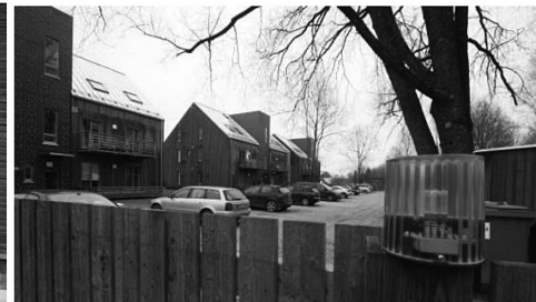
Figure 3. Changes occurring in the gentrifying area are visible in the cityscape. On the left: active use of public space. On the right: enclosed private courtyard of a new residential building used as a parking lot. No passage, the gate opens by remote control only.