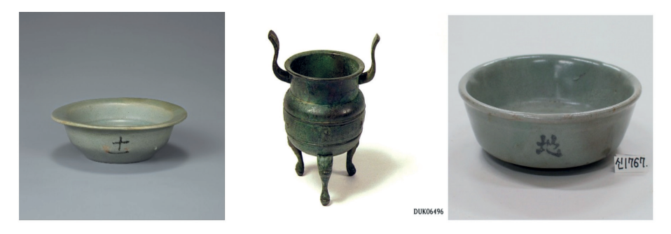
Figure 1. Utensils used for Daoist rituals.

(星辰醮祭, the ritual for the gods of stars) was conducted in the names of Sŏngsuch'o (星宿醮, the ritual for the god of Leo) (Jung 2015: 235-276), Puktuch'o (北斗醮, the ritual for the god of Big Dipper), Kŭmsŏngch'o (金星醮, the ritual for the god of Venus), T'aeŭmch'o (太陰醮, the ritual for the god of Luna), Chinmuch'o (眞 武醮, the ritual for the spirit of Baekje's patriotic nobleman), Chiksŏngch'o (直星 醮, the ritual for the god of the 'destiny star'), and Hyŏnghokkich'o (熒惑祈醮, the ritual for the god of Mars) (Jung 2015: 235-276, Kim 2008: 284-294; Annals of King Seongjong Vol. 77, February 18, 1477).<sup>32</sup> Kings Taejo (1398), Taejong (1403), and Sejong (1420) held the Daoist ritual of Kaebokshinch'o (開福神醮, for the blessing of king's descendants). The national rituals of Ch'ŏngmyŏngch'o (請命醮, the ritual for the sickness of the queen), and Kiuch'o (祈雨醮, the ritual for drought and rain<sup>33</sup>) ( Annals of King Sejo Vol. 12, May 12, 1458), like the ancient harvest ceremony, largely involved musical performances (Kim 2008: 284-294).<sup>34</sup>