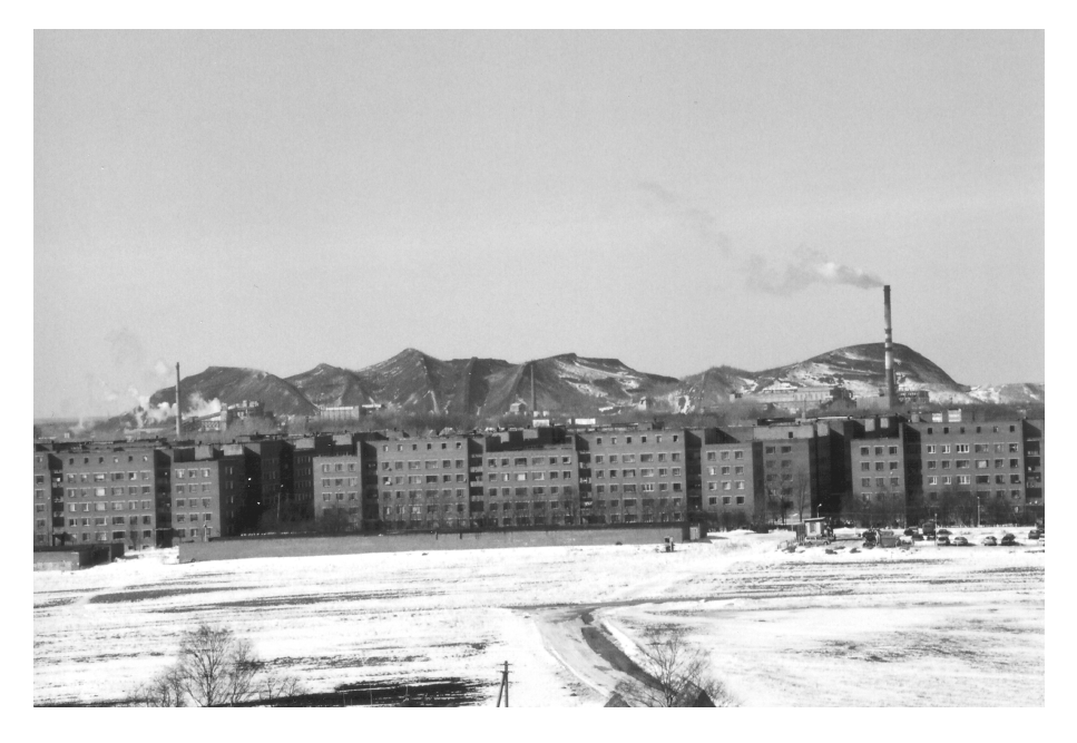
Fig. 3. Kohtla-Järve semi-coke mountains, known as North-East Estonian Central Ridge. The highest summit is the third from left (relative height 122 m)

There is a datum mark of 126 m above sea level at a knoll on the northern slope of old mountain of Kiviõli. The top of the knoll raises 79 m above the surrounding terrain and lies about 20 m lower from the top of the mountain itself. During the planning of a proposed ski centre on the old mountain in 2004, the relative height measured with GPS was 96 m. In summary, the relative heights of Kiviõli semi-coke mountains are 96 and 116 meters, respectively.