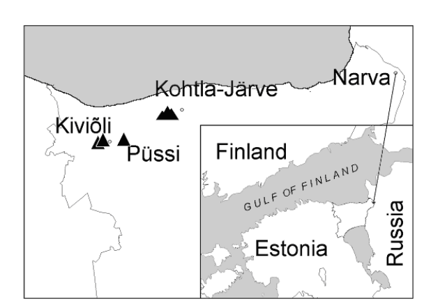
Fig. 1. Study area in Ida-Viru County

Most of the artificial landforms of oil shale industry lie in the north-eastern Estonian Plateau (Fig. 1) [5]. Quaternary deposits, the thickness of which is mostly less than 2 m, cover the limestone bedrock in this landscape region. The absolute height of the generally flat plateau reaches 30–50 m above the sea level, making the artificial landforms of oil shale industry conspicuous landmarks in the surrounding. The western ones lie near the town of Kiviõli, while the eastern ones are situated south from the town of Narva. Such landforms with similar origin are also found near the town of Slantsõ in Russia. Industrial mining of oil shale in Estonia began in 1916, and the total output has reached at 850 million tonnes by today.