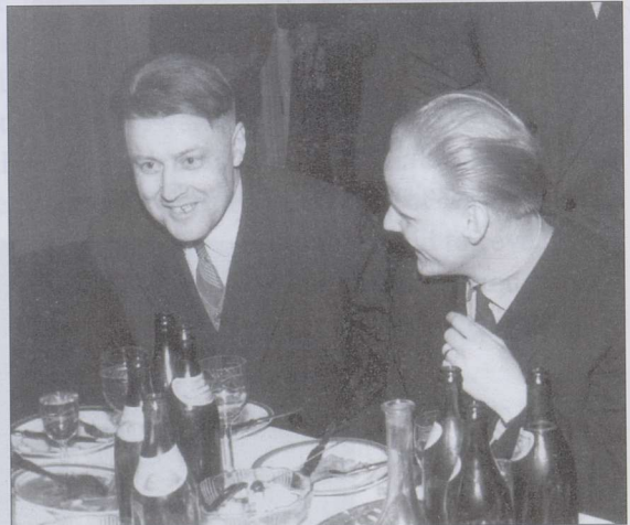
In Tallinn, 1960