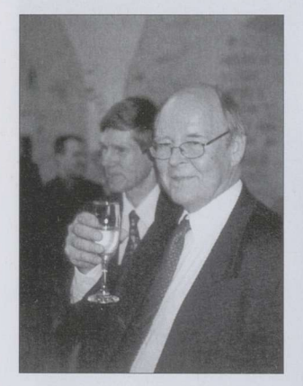
Representatives of Foster Wheeler are contented