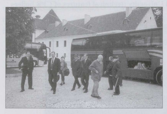
Arrival to the town of Narva

Signing the contract between Narva Power Plants Ltd. and Foster Wheeler Ltd. in Narva Hermann Castle in 2001