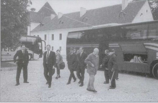
Arrival to the town of Narva