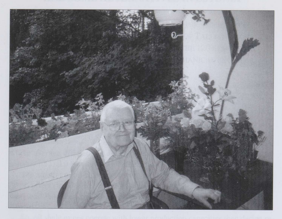
At home on his 84th birthday, June 17, 2001