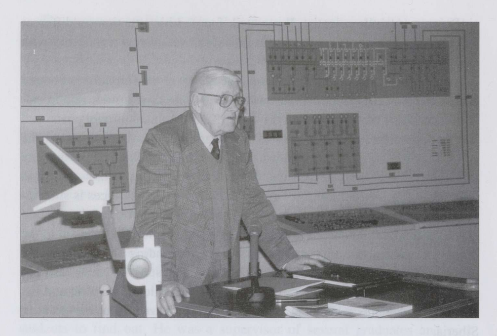
In the Energy Centre, a Museum of Energetics in Tallinn, 2000