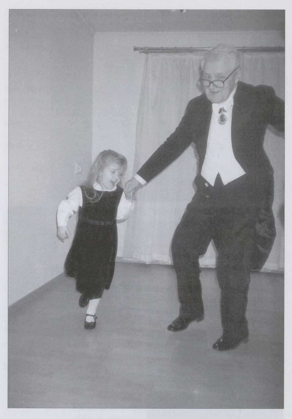
At a family gathering after the official reception of the President of the Estonian Republic, 1997 (one of the favorite photos)