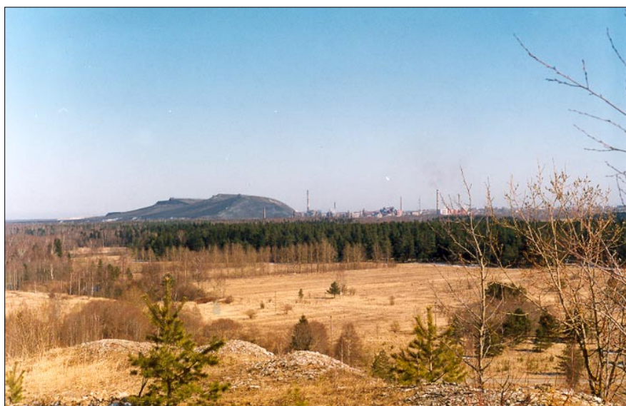
Fig. 2. The industrial landscape in NE Estonia: view of the semi-coke dumps (“black mountains”) in Kohtla-Järve