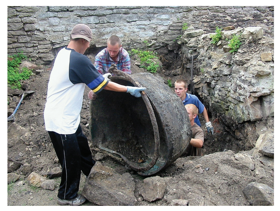
FIG. 8. Large copper kettle (HMK 7766:1 A 763) from the former Padise Monastery, later on used by the Muscovite and Swedish troops.

sphere was the reappearance of greyware cooking pots in all areas affected by the Muscovite troops. This form is seen in towns, castles and villages, and sometimes traditional greyware vessels are accompanied with whiteware vessels of similar shape, presumably from the Moscow region and associated with the arrival of people from the vicinity of Moscow (see Tvauri 2004 for details). However, such wares did not reach Tallinn, the only town not conquered by the Muscovite troops during the war.