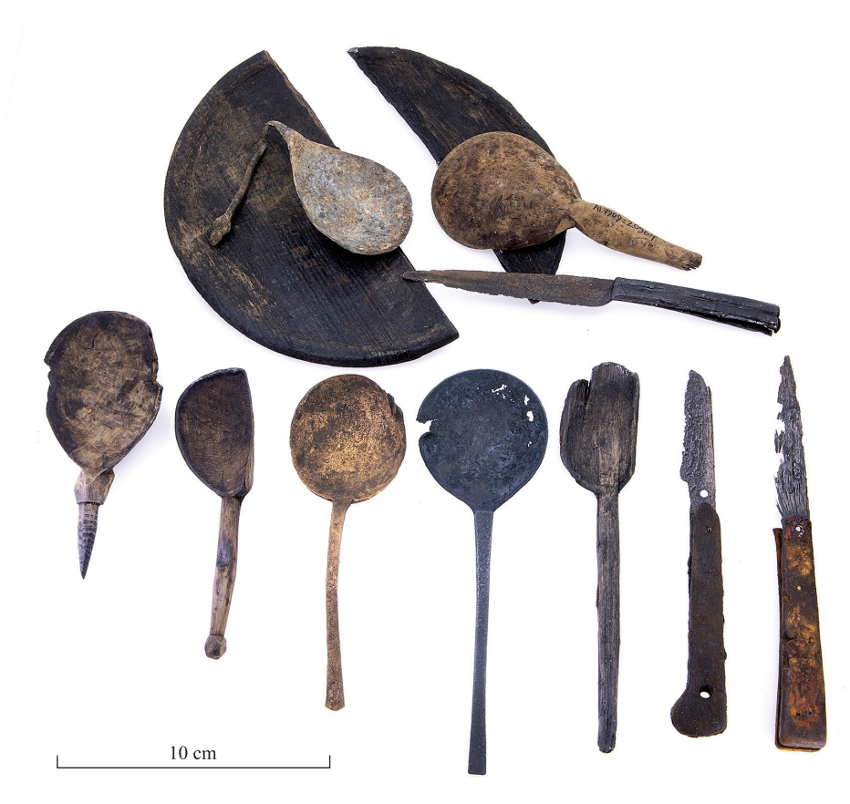
FIG. 7. A selection of late medieval tableware from the Kalamaja landfill in Tallinn (AI 7909: 20, 69, 114, 314, 10963,11371, 11372, 20964, 21770, 25578, 25558, 25560).

Based on written sources, also the first forks were in use in the households of higher ranking clergymen, reflecting items, tastes and customs brought along from southern Europe. However, no archaeological examples are available presently. The wills and inventory lists also often mention silver spoons as popular gifts to godchildren (Hahn 2015; Seeberg-Elverfeldt 1975), but only wooden and copper ones have been recorded in the archaeological record for the current period (Fig. 7). The same applies to special instruments: while salt cellars have been mentioned in written sources, we do not find these in archaeological collections, except in