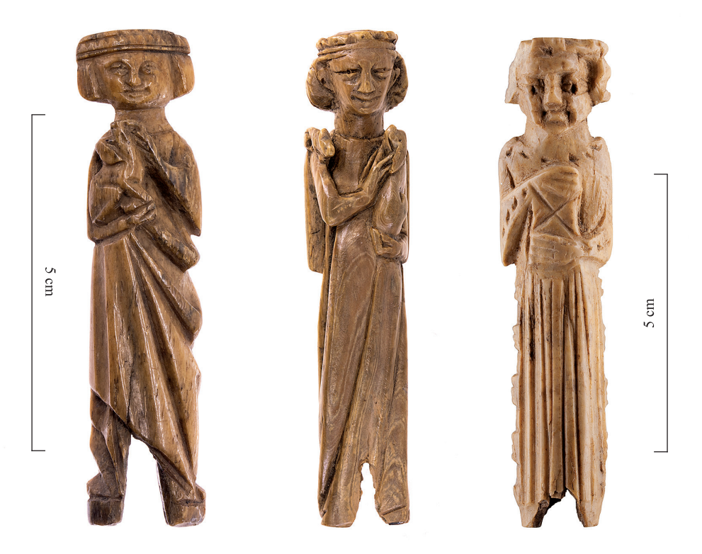
FIG. 6. Examples of exclusive cutlery handles from Tallinn and Tartu (AI 4061: 2207; TM A-51: 5306) and an inferior copy from Pärnu (PäMu A 2662: 1484).

times, now the first 'high-end' examples of cutlery appear (Fig. 6), and with these, also imitations of lesser quality.