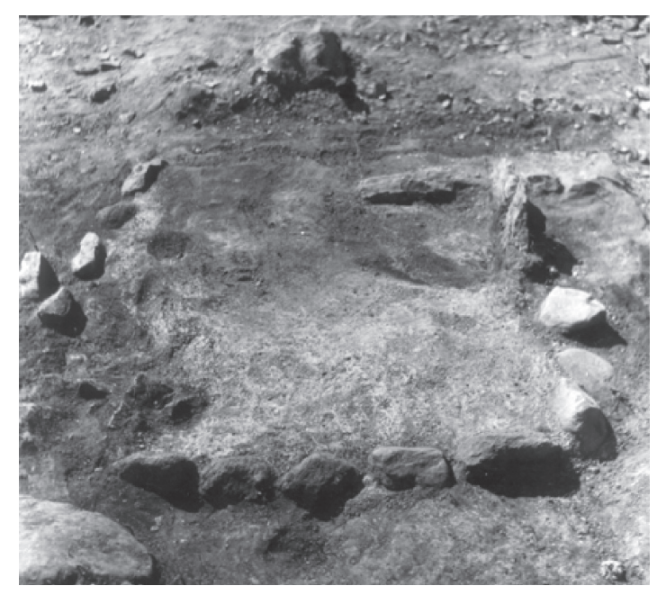
FIG. 2. The remains of the open fireplace in the mid-13th century front building of the merchant's house in Lihula.

As their design (handles and feet) sometimes directly imitated copper alloy tripods, we can be rather sure that metal vessels were also well known in towns during this period (see also Russow 2023). Furthermore, based on visual comparison with the 13th-century pottery production around the Baltic coast, it seems that typologically the most direct parallels to the Tallinn products come from the Roskilde–Lund area