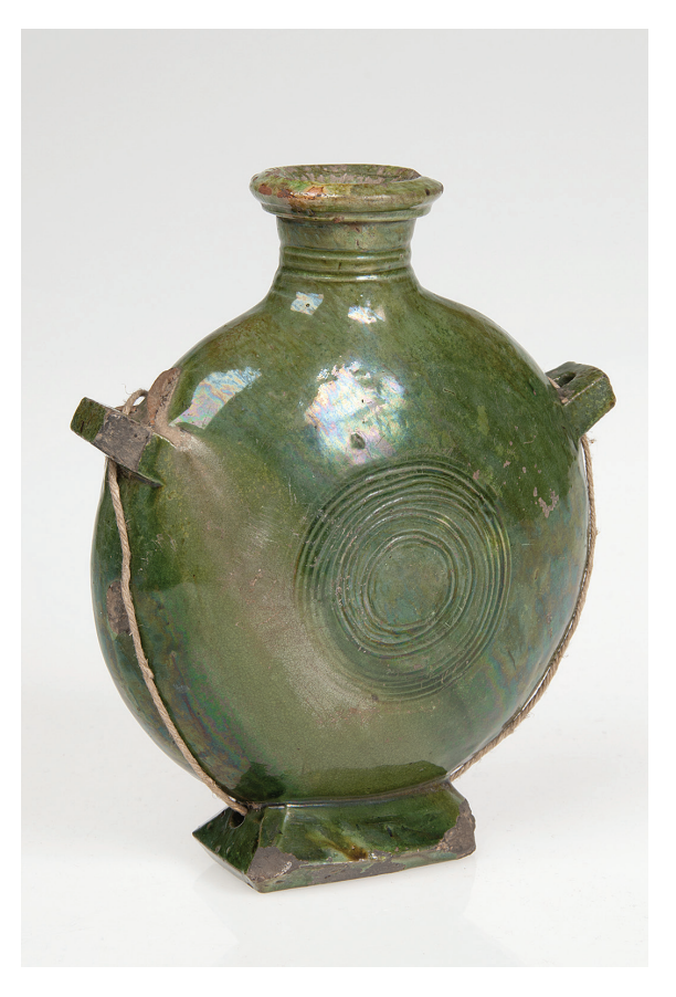
FIG. 9. Late 16th-century northwestern Russian greenglazed greyware field flask from Puiatu coin hoard, southern Estonia (ERM D 13:3).

starting to appear in the 1580s (Russow 2006b). Both painted redware and maiolica found relatively widespread use in the coastal urban society (including suburbs, at least in the case of Weser ware), yet the overall number of these finds is still too small to interpret their occurrence as a standard element of the urban household. They had, however, no impact in the rural setting.