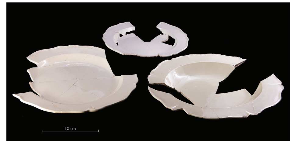
FIG. 11. 18th-century Queen's shape creamware plates from Toom-Kooli 15 property in Tallinn (AI 8596).

sphere, bowls for preparing sour milk and also preserving jars of glass appear (Reppo 2022, 160, 167).