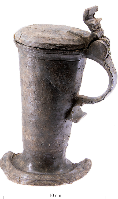
FIG. 10. 17th-century pewter tankard found from Saka hoard in Virumaa (AI 8738).

Innovation on the table is also perceptible in the evolution of drinkware. Compared to the previous period, we can grasp a dramatic fall in the use of stoneware: the former production centres (except Frechen, to a