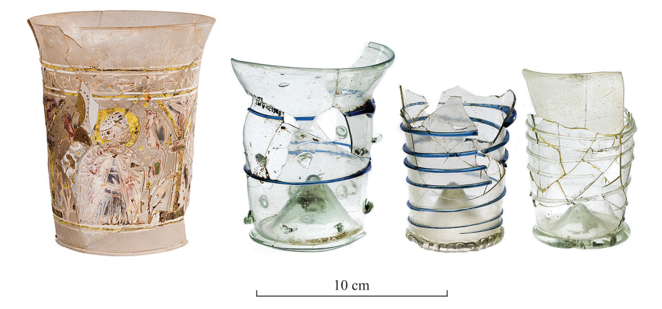
FIG. 5. Glass beakers from Tartu (TM A-108: A471, A485, A652; TM A-115: 728/767/1388/1389).

In addition to pottery, some of the stave dishes – probably the higher ones – functioned also as beakers (Vissak 2002, 166–168) and had widespread use in the urban space, as evidenced by the finds from Tartu and Tallinn. Glass vessels were also used on the table, but these usually found their way only into selected mid- and higher status households. Among the glass finds, the most noteworthy are the luxurious enamelled beakers (Fig. 5, second from right) very likely produced in Venice (e.g. Krueger 2018; Mäesalu 1999; Niilisk et al. 2017). These have been found in several Estonian urban centres and occasionally in castles (Pikasilla, Viljandi, Otepää), but in greatest numbers in Tartu. Further on, beakers decorated with glass thread (both ribbed beakers and those with spiral thread) appear in urban centres (Fig. 5). The glass vessels of this period can mostly be associated with wine drinking. Last but not least, besides common knives that are visible throughout the