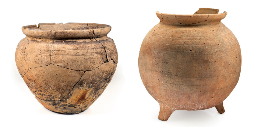
FIG. 3. Two regions, two potting traditions: 13th-century local flat-based pot from Viljandi (VM 10620: 935/2) and tripod from Tallinn (AI 6713: 270).

Whether the smaller urban port towns had their own pottery workshops is hard to tell, as the finds are, by and large, visually indistinguishable from the Tallinn products. What is clear is the limited influence of western European potting traditions in continental areas – so far, only a very limited number of fragments of locally made tripods have been found in Tartu, and not elsewhere in southern Estonia (Fig. 3). The explanation might be cultural or circumstantial, or both simultaneously: the previous (prehistoric) potting tradition was strongly rooted and the emerging urban society in southern Estonian towns continued to use former vessel types because of the well-established craft that rejected western pottery traditions. Or, based on the demographic situation, this might indicate a considerably higher number of interethnic marriages where male immigrants chose local women as partners,