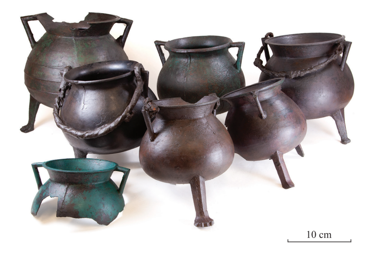
FIG. 4. A collection of tripod pots from the first half of the 14th century, found on a wrecked cog in Tallinn (MM 15329).

Finally, there exist a few brickware spit supports, which, together with dripping pans, give evidence of another cooking practice – roasting meat on open fire. Based on the mapping of the dripping pans in Tallinn, this practice was not exclusive here to better-off households (see Russow & Gaimster 2017; Russow & Haak 2018b) and