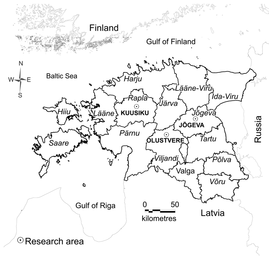
Fig. 1. Location of experimental areas on the map of Estonian counties.

soil cover, which may be quantitatively expressed by the content (concentration and stock) of SOM, soil organic carbon (SOC) or energy captured into SOM. In other words, the humus status characterizes the SOM/SOC flux (input → sequestration → output) via soil cover. Soil organic matter is taken here as a whole or a complex component of soil cover, which in addition to the stabilized humus substances dominating in cropland soils, contains also the litter of plants and soil organisms incorporated into the soil, as well as fine roots and microorganisms of the soil living phase. The quantitative analysis of the soil humus status in actual work is based on SOC concentration ( \text{g kg}^{-1} ), humus cover thickness (cm) and SOC stocks ( \text{Mg ha}^{-1} ), but the semi-quantitative analysis is based on humus cover types ( pro humus forms) and humus cover fabric. A similar understanding is used for the agrochemical status of soils, which comprises not only NPK, but also the acidity and Ca status of the cropland soil cover. The environmental status of soil covers is characterized by the evaluation of its EPA.