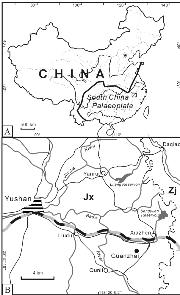
Fig. 1. Location map of the study area. (A) Map of China, with Beijing marked by a star and the study area in East China by a streaked square. (B) Enlarged map of the study area (Guanzhai of Xiazhen), Yushan County, northeastern Jiangxi Province, marked by a solid circle. Jx, Jiangxi Province; Zj, Zhejiang Province.

report the occurrence of encrusting cornulitids on the Ordovician brachiopods from the South China Palaeoplate, and to discuss the palaeoecological implications of their commensal relationship.