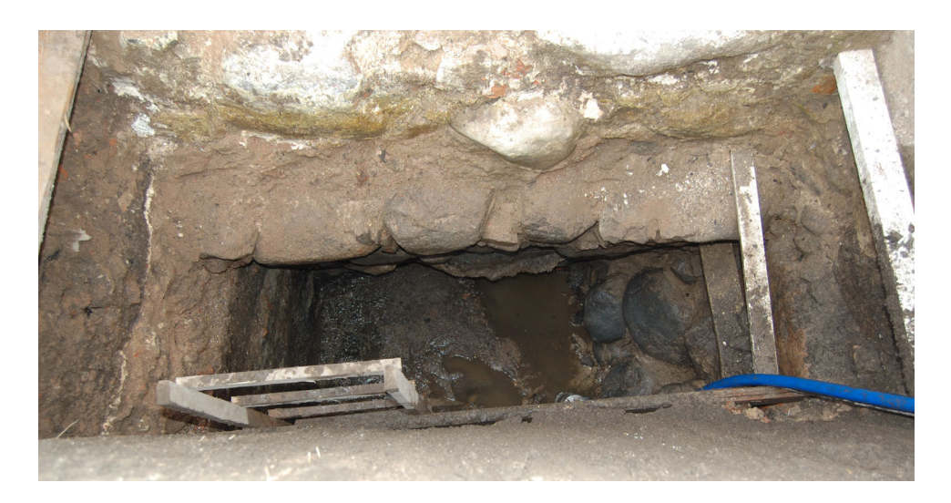
Fig. 3. Town wall in the excavation pit in Vabaduse Avenue (according to Bernotas 2010a).

towers, bricks are also used abundantly (Hermann 1974, 43; Tiirmaa 1977; Alttoa 1979, 29; Piirits 1996; 2006, 8; Vissak & Heinloo 2006, 113 f.; Heinloo & Vissak 2010, 11). In single cases slate stones (Metsallik & Tiirmaa 1996) and monk-nun type of roof tile fragments (Piirits 2008, 3 f.) have been used for cladding the wall.