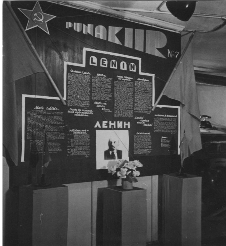
Photo 1. Wallboard “Red Ray” 1941 (Seinaleht “Punakiir”) to celebrate Lenin’s death anniversary in 1941. Estonian History Museum (AM 1480/R F 2569).

How was the situation perceived by people from community organizations, who had up until August 1940 operated on free citizen initiatives, upon their reading of the new rhetoric and guidelines? Per Wiselgrad (1942, 105) has described that many people perceived the hypocritical rhetoric of the new regime as mental oppression. The constitution solemnly promised freedom of the press, speech, association and personal security; in reality none of it was true: