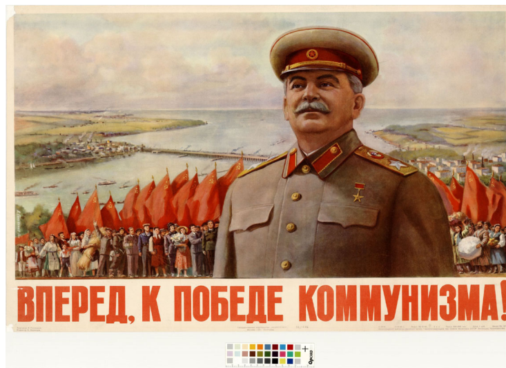
Poster 2. Expression of “national diversity” and “ultimate unity”. Estonian History Museum, Collection of Posters (F158-1-23).

As Slezkine (1994, 418) explains it, Lenin’s socialists needed native languages, native subjects and teachers (“even for a single Georgian child”) in order to “polemicize with ‘their own’ bourgeoisie, to spread anticlerical and antibourgeois ideas among peasantry and burghers” and to “banish the virus of bourgeois nationalism from their proletarian disciples and their own minds”. Mertelsmann (2012, 12) points out that the Soviet nationalities policy, based on the concept of korenizatsiia (“taking root”), to build up and secure the central power the Soviet system needed the help of national cadres. The basic concepts for national and cultural policies were worked out by Lenin and developed by Stalin. The Soviet concept of “national diversity” and “ultimate unity of nations” under the red flag and leadership of Stalin, has been visualized on poster 2: