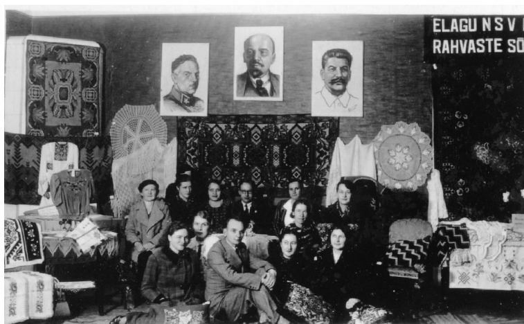
Photo 2. Women’s handicraft exhibition in a Valga community house, with leaders and a banner saluting the “Friendship of the Nations” on the wall, 1940. Repro, Estonian History Museum (N15056).

In Soviet grass-roots-level cultural work, persistent checks, reports, fixed repertoire in music, theatre plays and other amateur arts became an inevitable part of everyday life from the first days of the new regime. The legislative basis for Soviet censorship was the Decree on the Printed Word, adopted on October 27, 1917 by the Council of Peoples’ Commissars, and it was in force until 1990. The role of censorship (pre-, post- and permanent censorship) was broad – all artistic creations (literature, music, art, newspapers, TV and radio programs, as well as amateur art practices in community houses) were subject to it. As Veskimägi (1996, 327) notes, “not a single printing office accepted any manuscript without the imprimatur of the censor. The Soviet censorship system was duplicated and performed by many authorities – by the central committee of the CP of the republics, the KGB, the Council of Ministers and Glavlit [The USSR Chief Office of Literature and Publishing Affairs]. 83