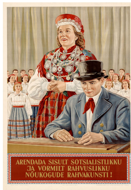
Poster 3. “To Develop Soviet Folklore: Nationalist in Form and Socialist in Content!”

A specific feature of Soviet cultural policy was its highly bureaucratic nature. As all cultural organizations were state funded, they were also guided and controlled