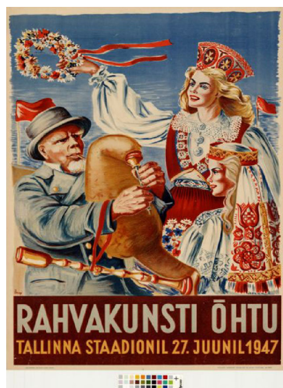
Poster 1. Evening of Folklore Art in Tallinn 1947. Estonian History Museum, Collection of Posters (F158-1-36).

The government sponsored village expeditions to gather folkloric materials, folk singing competitions, and festivals of national art featuring works produced by various Soviet nationalities. The government established the N. Krupskaya All-Union House of Folk Art in Moscow, as well as institutes of national culture all over the country. 33 Folk culture was used by party leaders to promote controlled and artificial representation of Soviet forms of national cultures. An example of political representation of Estonian folklore, see poster 1 from 1947: