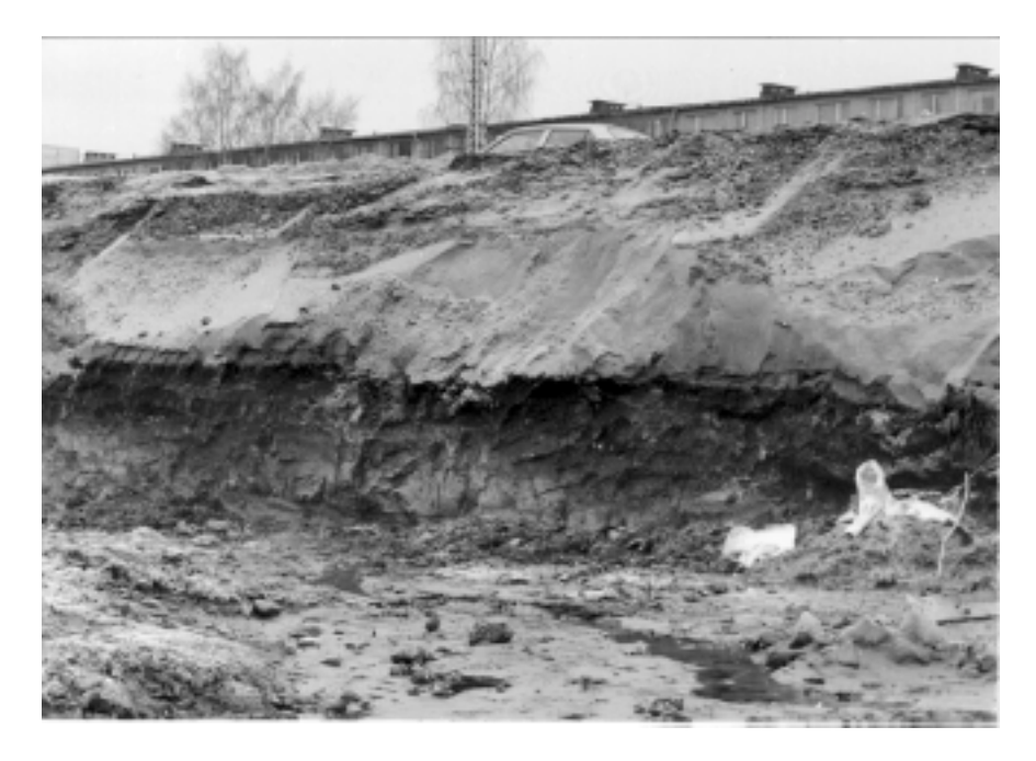
Photo 1. About 1 m thick peat layer at Lepistiku is buried by 2 m thick sand. View from south to north, towards Sõpruse Avenue.