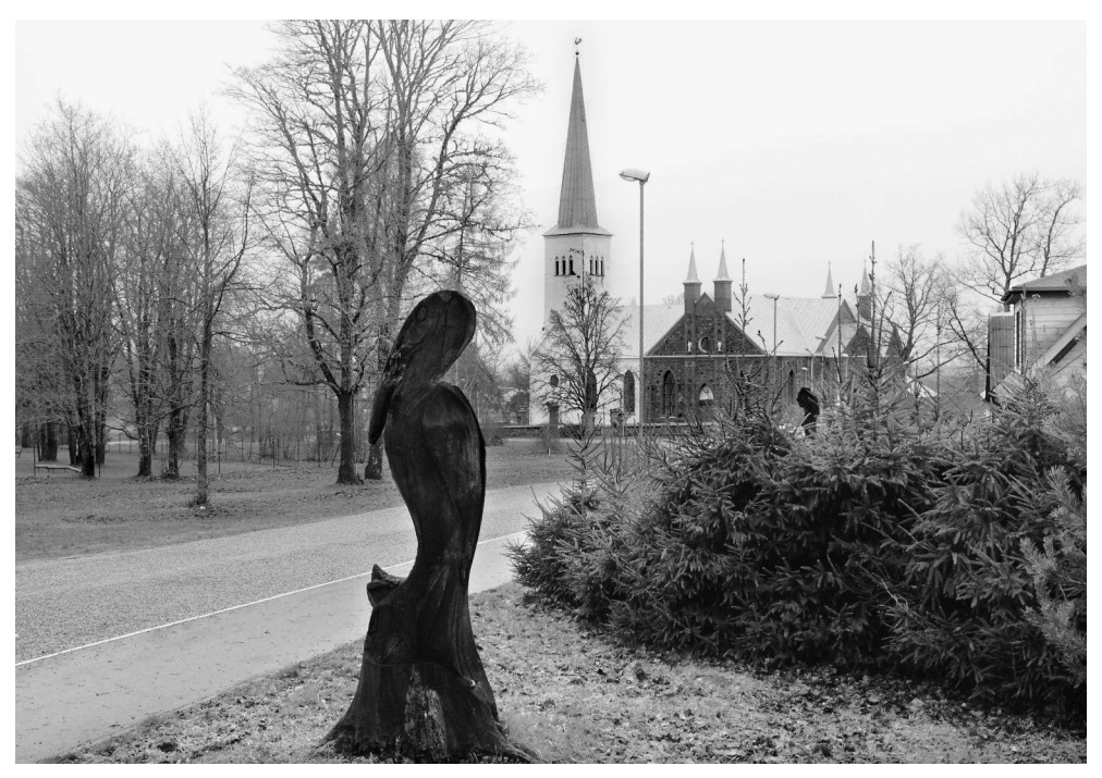
Figure 2. Figure of a raven. Estonia, Kambja. Photo by Andres Kuperjanov 2013.

To characterise the former, Sofield remarks that the establishment of a place that is directed and managed by community leaders provides roots for emic, folkloric, and community-led initiatives, as distinct from the formal, so-called industrial construction of spaces. Expressions that are of interest to tourism are created even if tourism has not been the primary motivator (Sofield et al. 2017: 2). This position fits the Estonian sacral landscape and public space; the figures are original, and they are connected with local mythology and folklore, even if they are tied specifically to the creation of a religious site. By such means, an ordinary landscape is rendered multi-dimensional and interesting, and connections are forged between more distant history and folklore.