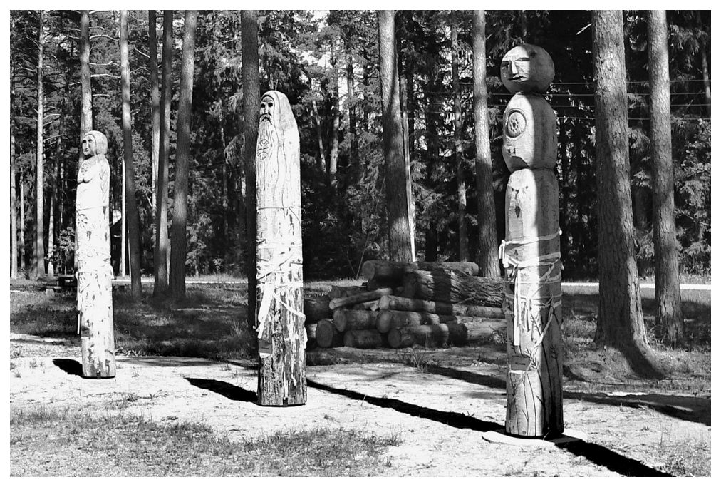
Figure 1. Wooden ancient gods on both sides of the marathon finishing line at the Elva Recreational Sports Centre.

In 1989, with the support of Jõgeva County and the Estonian Forest Society, the local village community and volunteers, a sacred grove ( hiis ) was established nearby the Kassinurme hillfort, which had been in use until the thirteenth century. The new place included a range of creative cultural structures, as well as nature and sporting trails. Again, this is a multifunctional site, used by various communities for their own purposes. At the sacred grove local residents celebrate holidays in the folk