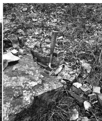
Fig. 1. A view of the Pähkla Quarry (A) and the available outcrop section (B, a detail of the lower right corner of figure A).