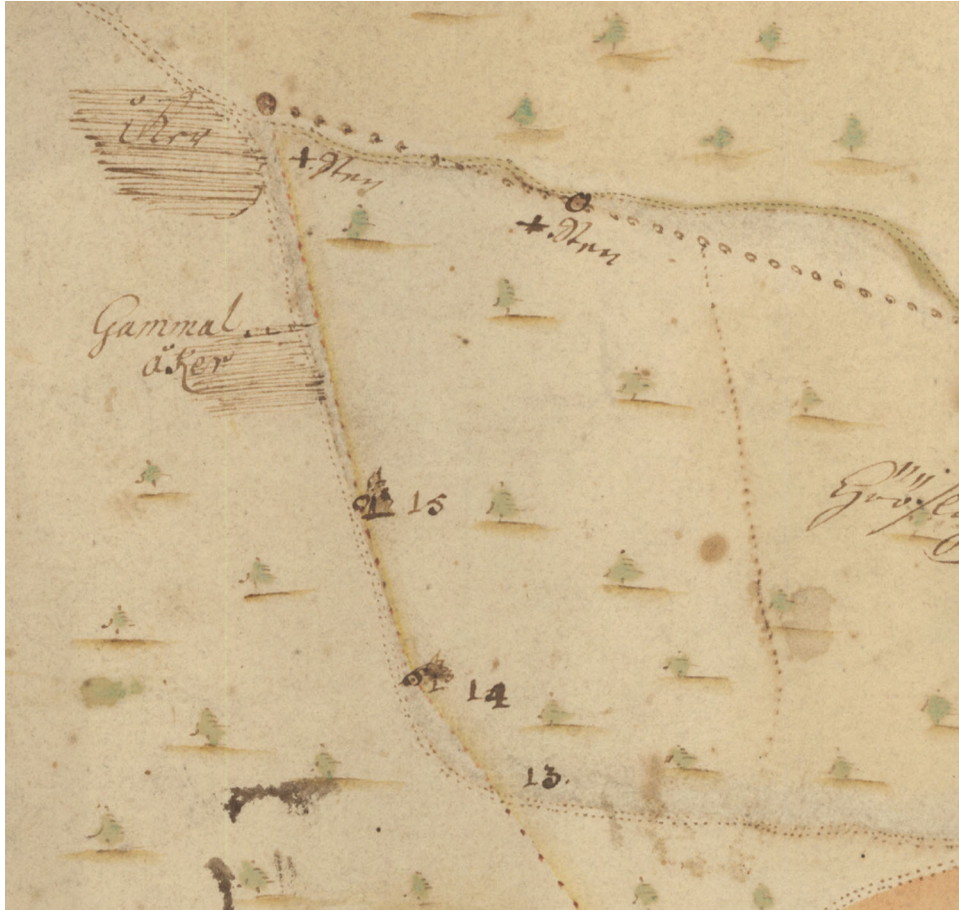
Fig. 2. A fragment of the 'Peduwa Hoffs' lands of Märjamaa Parish, Estonia, from the 1680s. Two trees with crosses carved into them serve as boundary marks (14, 15) (EAA 1.2.C-IV-308).

was important to show the course of an earlier boundary. Boundary marks may have been made on stumps of spruce, pine, aspen, birch, alder, as well as oak; in some cases the stump was more thoroughly described: a stump of a large oak, that of an old oak, or just a large stump (EAA 308.6.118). As a rule, stumps were marked by a cross.