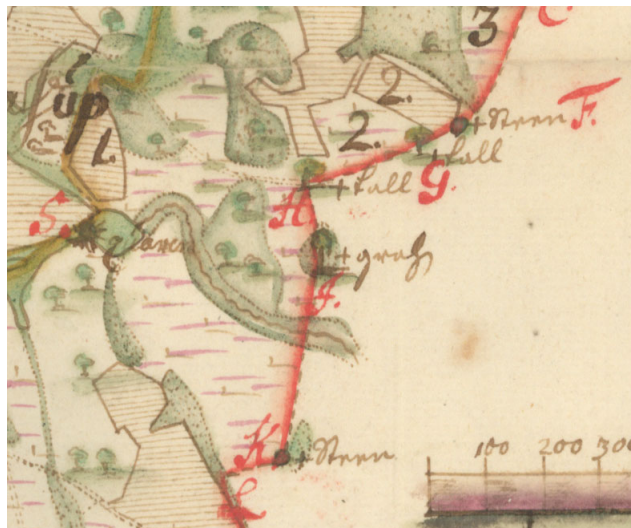
Fig. 1. A fragment of the boundary map of Ruusmäe and Viitina of Rõuge Parish, Livonia, from 1694. There is a spruce and pines with crosses carved into them among boundary marks (EAA 308.2.179).

Stumps and fallen trees were also found on maps from the 1680s and later. Surveyors often updated old, earlier drawn maps that included these features, so they were retained. For example, the 1680 map of Märjamaa (EAA 1.2.C-IV-308), which is based on an earlier map, had boundary stones marked with crosses, birch trees with crosses and a crooked stemmed birch with no cross, and a tree stump and a fallen tree with a cross cut into them (Fig. 2). Stumps can also be seen on later boundary maps, particularly in the case of disputable boundaries where it