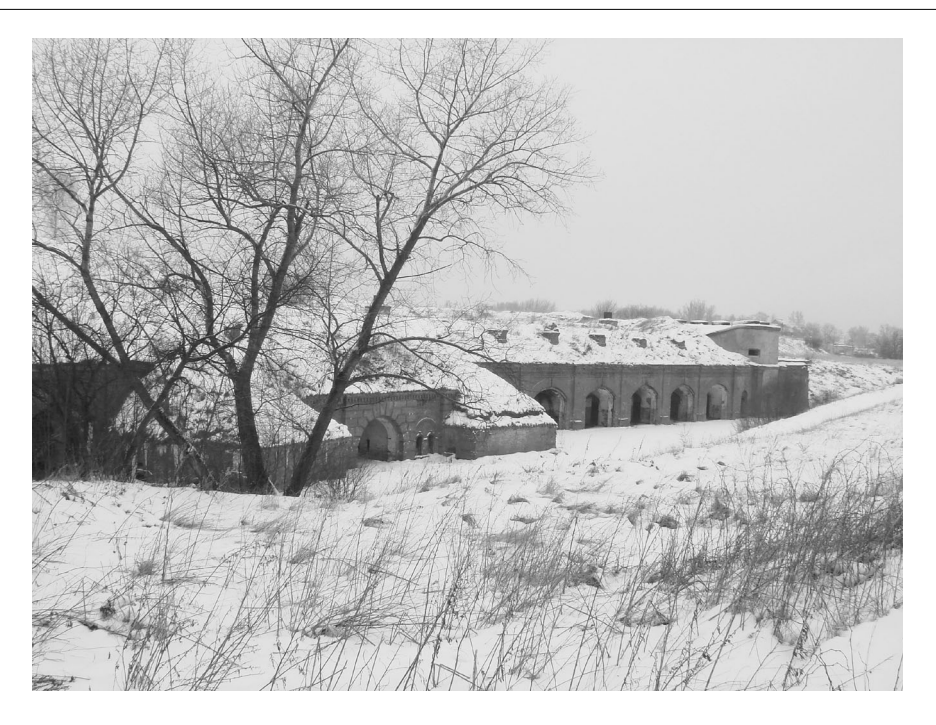
Fig. 2. Main building of Fort 1 in February 2007.