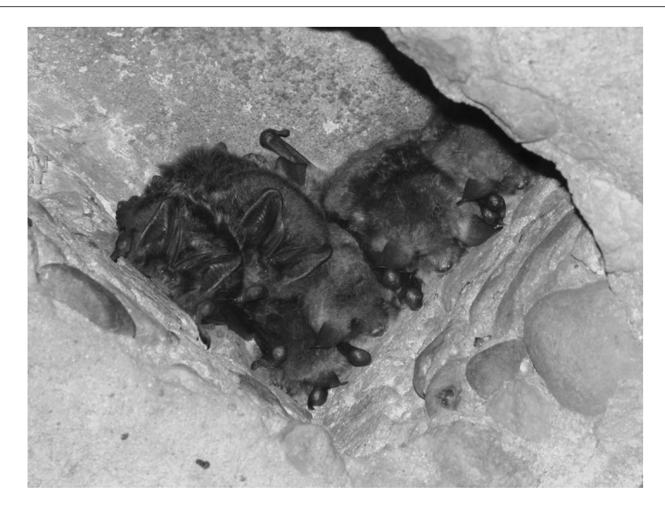
Fig. 5. Two Barbastelles and five Natterer's Bats hibernating in a hole situated in the ceiling of a tunnel in roost No. 2/8 of Fort 2.

or the whiskered bats group ( Myotis brandtii or M. mystacinus ) (P. Strelkov's method of 'bending ears' in M. daubentonii ; Strelkov, 1963). Separating the sibling species of M. brandtii and M. mystacinus was done using external characters, e.g. the shape of ears and the colour of face, ears, and tragus (Masing, 1987, 1996; Schober & Grimmberger, 1998). Brandt's Bats ( M. brandtii ) usually hibernated on walls of underground roosts (Fig. 6); thus their field identification characters could be examined easily. We found no animals bearing the characters of M. mystacinus .