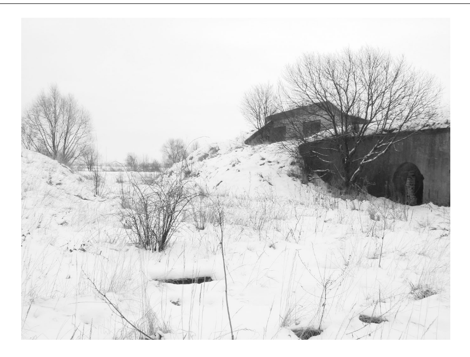
Fig. 4. A small white building on underground roost No. 1/4 situated in the southern part of Fort 1. In deep wall crevices of this room 31 Barbastelles, representing 29% of the total hibernating community of this species found in Kaunas Fortress in 2007, were found hibernating in chilly conditions.

hibernate there, too. Fort 9 is probably not suitable for bat hibernation any more because there is a museum, although hibernating bats were found there during earlier counts (Masing & Buša, 1983; Pauža & Paužienė, 1996). In 2007 bat counts were carried out at forts 5 and 6 probably for the first time.