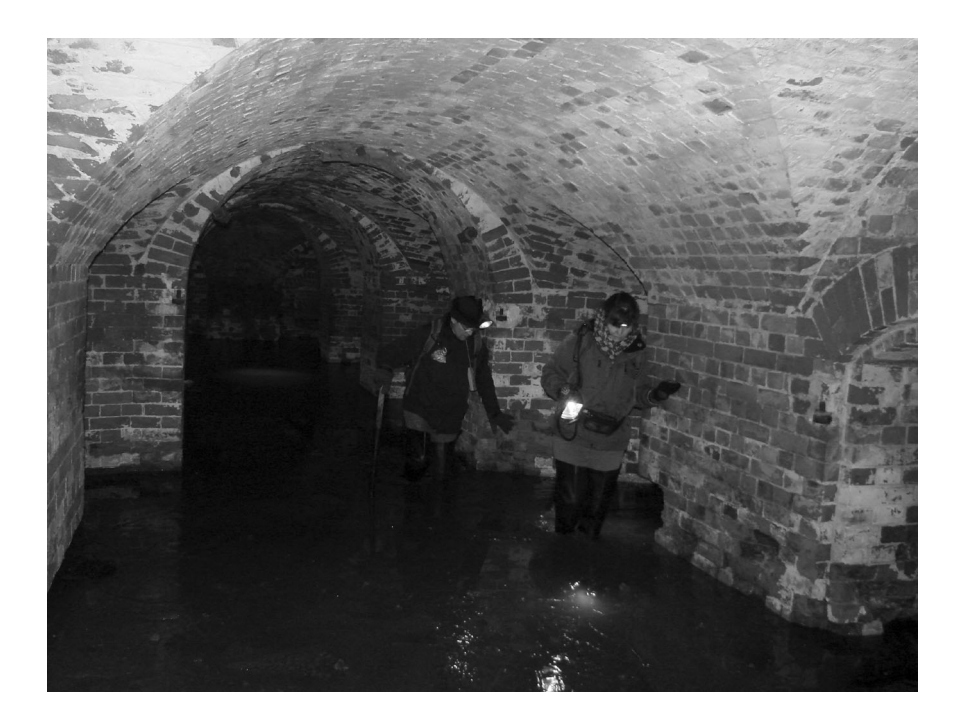
Fig. 3. An underground system built of red bricks in Fort 6. The floor is covered with ice and water.