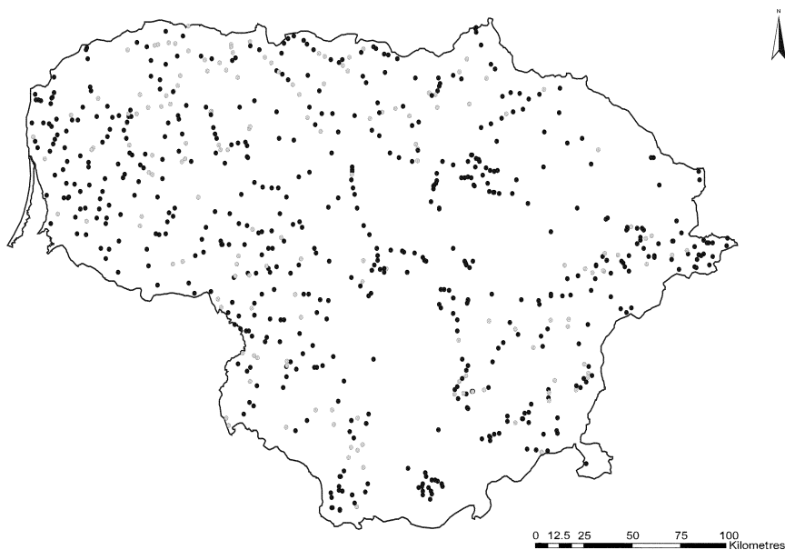
Fig. 2. Otter distribution in Lithuania in 2007–2008 (black circles – positive sites, grey circles – negative sites).