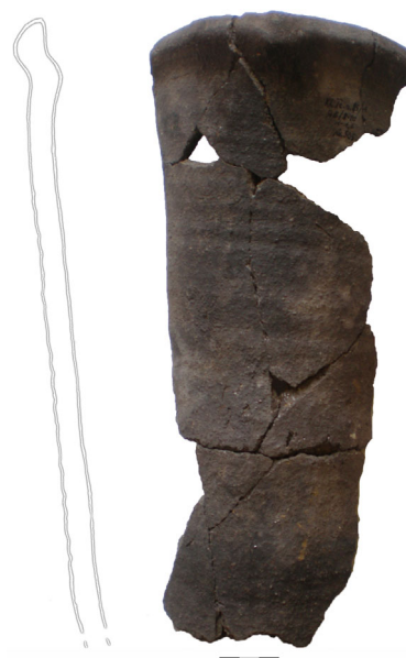
Fig. 5. A deep vessel stove tile from the second half of the 14th century. Found in the town dump. Photo and drawing by Raimonda Nabažaitė.

Individual pieces of impressively sized deep vessel tiles were found within the conglomeration of waste. A more fully preserved example of this type of tile shows that they were cylindrical in shape with a quadrangular opening, one side of which equalled 15 cm. According to the measurements taken, they may have been as high as 30 cm or even higher (Fig. 5). Their sides were right-angled and grew slightly wider towards the tile's opening. It does appear that their base was flat, and this opinion