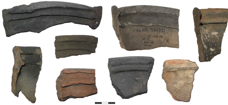
Fig. 2. Fragments of vessel stove tiles dated from the second half of the 15th – early 16th century.

Unfortunately, the preserved undisturbed cultural layers of the oldest historical part of Klaipėda which contain vessel tiles belong to a later period than the founding of the city. A cultural layer with vessel stove tile fragments dated to the second half of the 14th–15th century was uncovered during archaeological excavations of the oldest part of Klaipėda in 1975–1976 (Žulkus 1976; 1978). Later publications on this investigation, however, have corrected the stove tiles' chronology to the second half of the 15th – early 16th century (Žulkus 2002, 83 ff.). Stove tiles of a chronologically close period were also unearthed in a few more locations that were explored within the environs of the castle and the town next to it (Sprainaitis 1985; 1986; 1990), and it was these sites that presented some of the oldest stove tiles found in undisturbed cultural layers (Fig. 2). One can only regret that it is solely fragmentary stove tiles that have been found. Due to a lack of data, a reconstruction of stove tile shapes and size is impossible. Nevertheless,