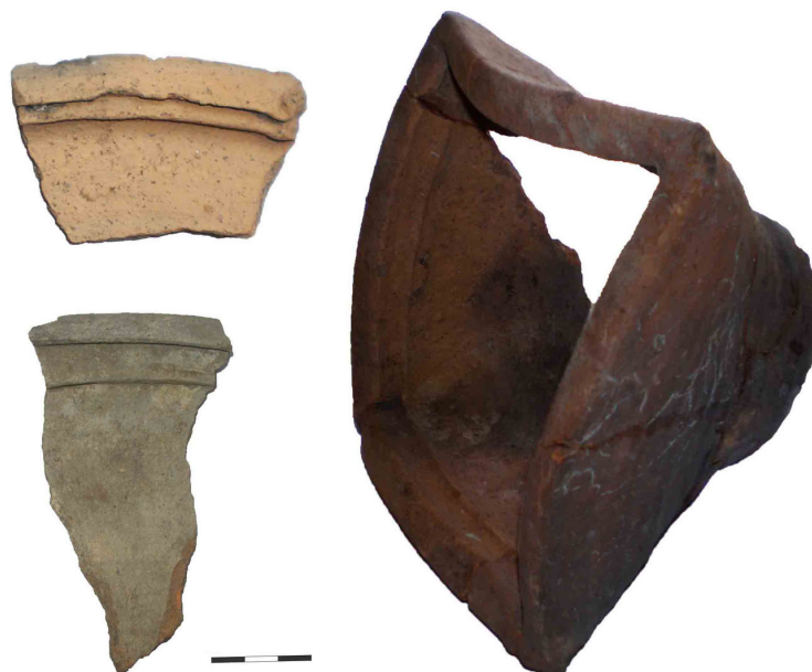
Fig. 4. Vessel stove tile and fragments from the town dump.

evolutionary process of tiles? The previously discussed situation illustrates that the stove tiles recovered in those layers that are not problematic to date reach back only to the second half of the 15th century. The material from the dump that was piled at the border of the town, however, allows us to posit a much earlier period for the appearance of tile stoves and thus broadens the concept and chronology of the oldest tiles.