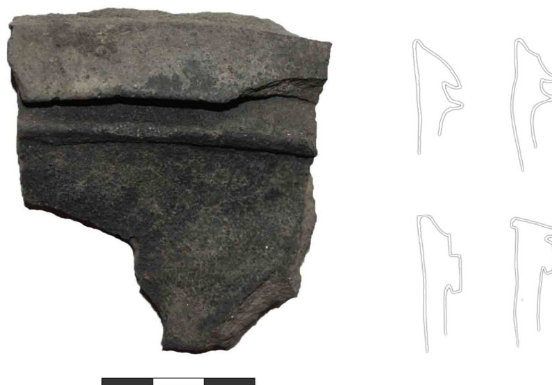
Fig. 3. Fragment of vessel stove tiles and different profiles. Found in the defensive ramparts of the early 17th century. Photo and drawing by Raimonda Nabažaitė.

Analogous or very similar tile fragments were found within the chronologically later cultural layers which formed during the development of the fortification of the castle. In the course of these events the earlier cultural layers of the castle and town were destroyed, and the finds from these layers found their way into the areas where the construction works took place. The tile fragments (Fig. 3)