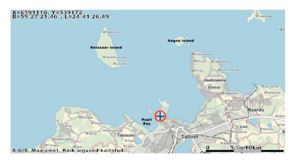
Fig. 3. Location of the brickyard and surroundings on the contemporary map of Tallinn. Map from the Estonian Land Board website www.maaamet.ee. Map modified by Rivo Bernotas.

amount from the town's funds each year until the contribution was expunged. It seems that the rights to the brickyard had been redeemed by the town by 1370 as there are no bills of payments in the town account books for the following years (Kivi 1966, 143 f.).