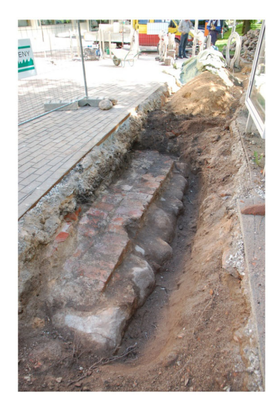
Fig. 6. Town wall on the north-east side of the crossroad of Küüni and Poe streets. View from south.

South-west from the crossroad of Küüni and Poe streets, the width of the wall was 2 metres. A remarkable discovery was the edge made of bricks, perpendicular to the town wall, which may mark a passageway or aperture in the town wall. The dimensions of the bricks used in the masonry were 8 \times 15 \times 31 cm (Heinloo 2012, 19).