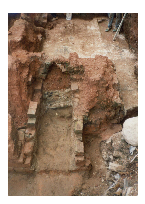
Fig. 4. Brick kiln from 1 Kitsas St. View from north.