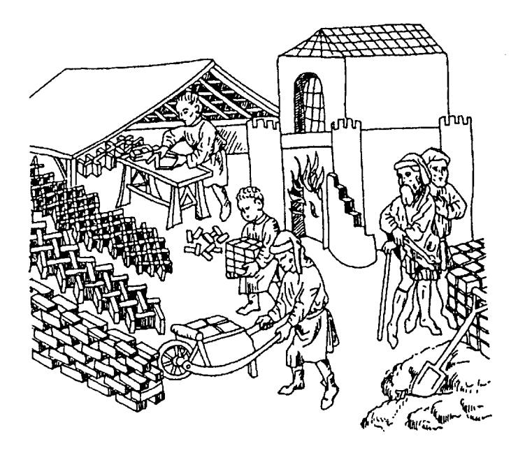
Fig. 1. Brick-making in the Netherlands (Binding 2004, 83).

Brick-making (Fig. 1) was one of the prerequisites for the implementation of various construction projects which were run by noblemen. Aristocracy was