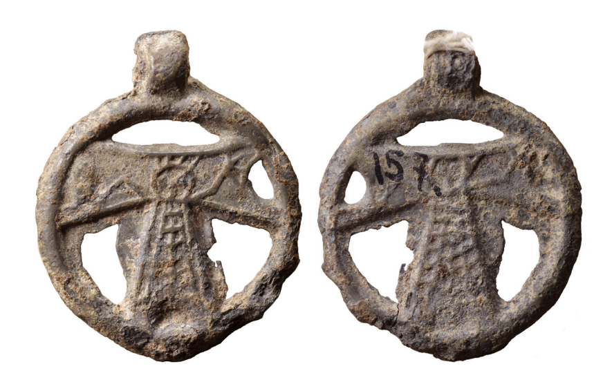
Fig. 1. Avers and revers of the pendant from Aseri stone-grave (RM A 5: 190).

figure seems to wave but we can assume that the master has tried to depict the crucified Christ. Similar figure, with some minor differences, is depicted on the other side of the cross but here the depiction is more obscure.