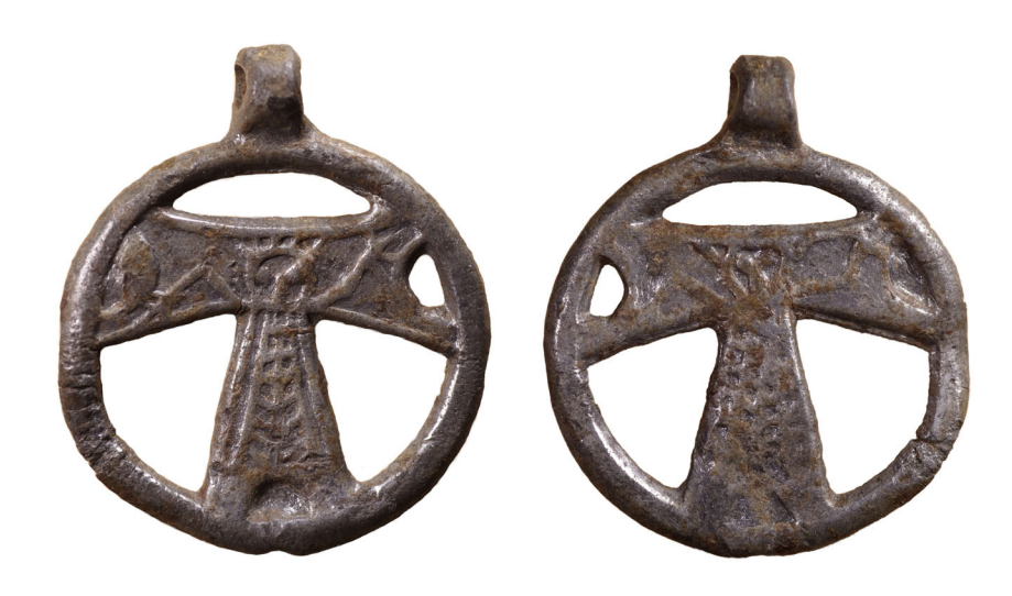
Fig. 2. Avers and revers of the pendant from Ojaveski village (in private collection).