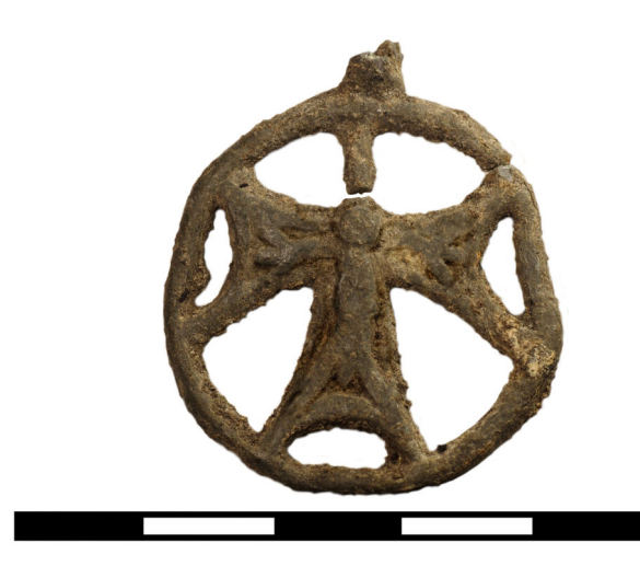
Fig. 6. Pendant from the Early Modern Age debris layer, Tallinn (AI 6467: 311).

The location of the master (and the market) is very speculative as we know rather little about the inner trade of medieval Estonia. As three pendants come from Virumaa, this area should perhaps be a priority. Considering that Rakvere was the only town in the 16th–17th century Virumaa, the market where some of the pendants were sold could have taken place there. In addition, a goldsmith is mentioned from the 16th-century Rakvere (Russow 1988, chapter 65). In the late 17th century three smiths and two goldsmiths have been recorded in Rakvere as well (Kirss 2005, 46). These masters possibly made jewellery for local rural population also, and thus it could be plausible to find their works in rural contexts. But even though the jeweller in Rakvere could have made tin pendants, his skills of carving the mould must have been much more elaborate than is the case here.