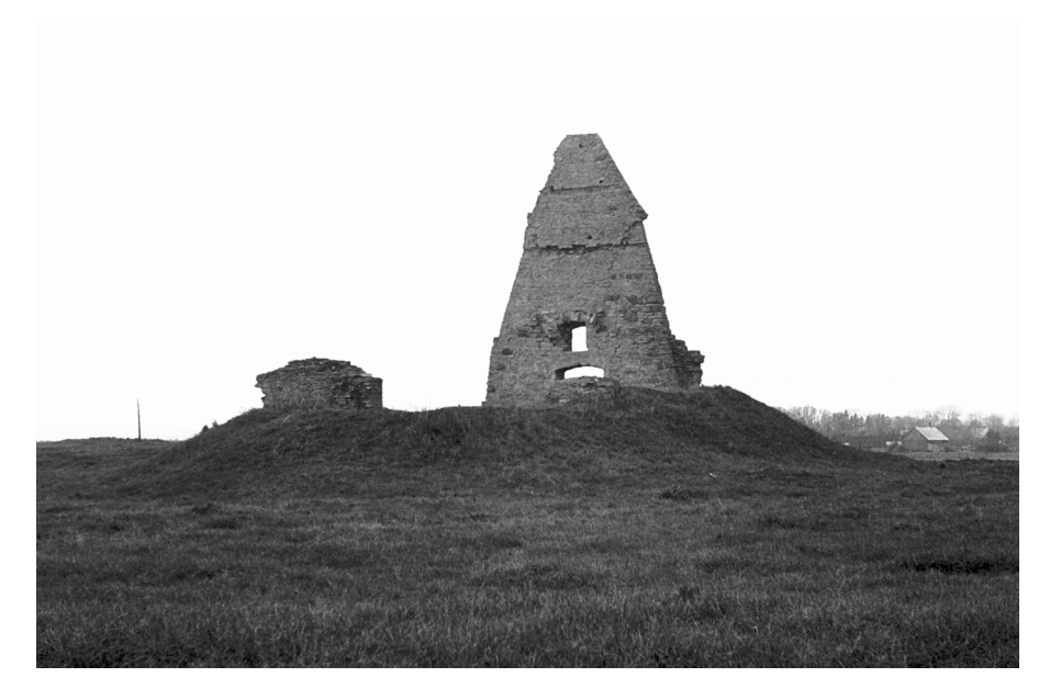
Fig. 7. Ruins of St. Mary chapel from Viru-Nigula.