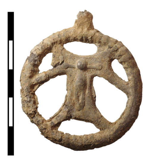
Fig. 5. Pendant from the Piilsi Rajara cemetery (AI 3351: 6).

Possibly the urban Our Father pendants from the 16th century (Kirme 2002, 74) gave inspiration to depict Crucified Christ on such small tinlead pendants. Christ in the similar