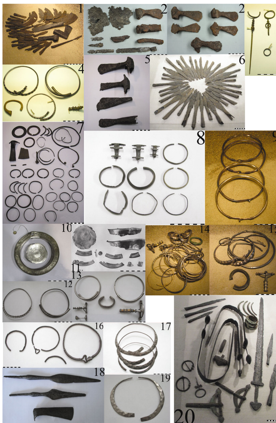
Fig. 2. Estonian Middle Iron Age wealth deposits. 3