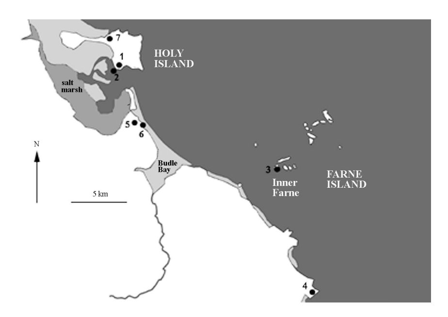
Fig. 2. Holy Island and Bamburgh. 1 Lindisfarne: monastery, 2 Lindisfarne: St Cuthbert's Isle, 3 Inner Farne: Cuthbert's hermitage, 4 St Ebba's Chapel, 5 Bamburgh Castle, 6 Bowl Hole cemetery, 7 Green Shiel.

The major secular power centre of Bamburgh lies just 8 km across the water from Holy Island, and the two are clearly intervisible. Bamburgh is recorded in Bede and the Anglo-Saxon Chronicle as a major Anglo-Saxon caput (e.g. HE 3.16; ASC sa. 547). Bede also records that the relics of St. Oswald lay in a church